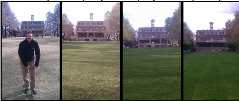
Soil Analysis: Day 1